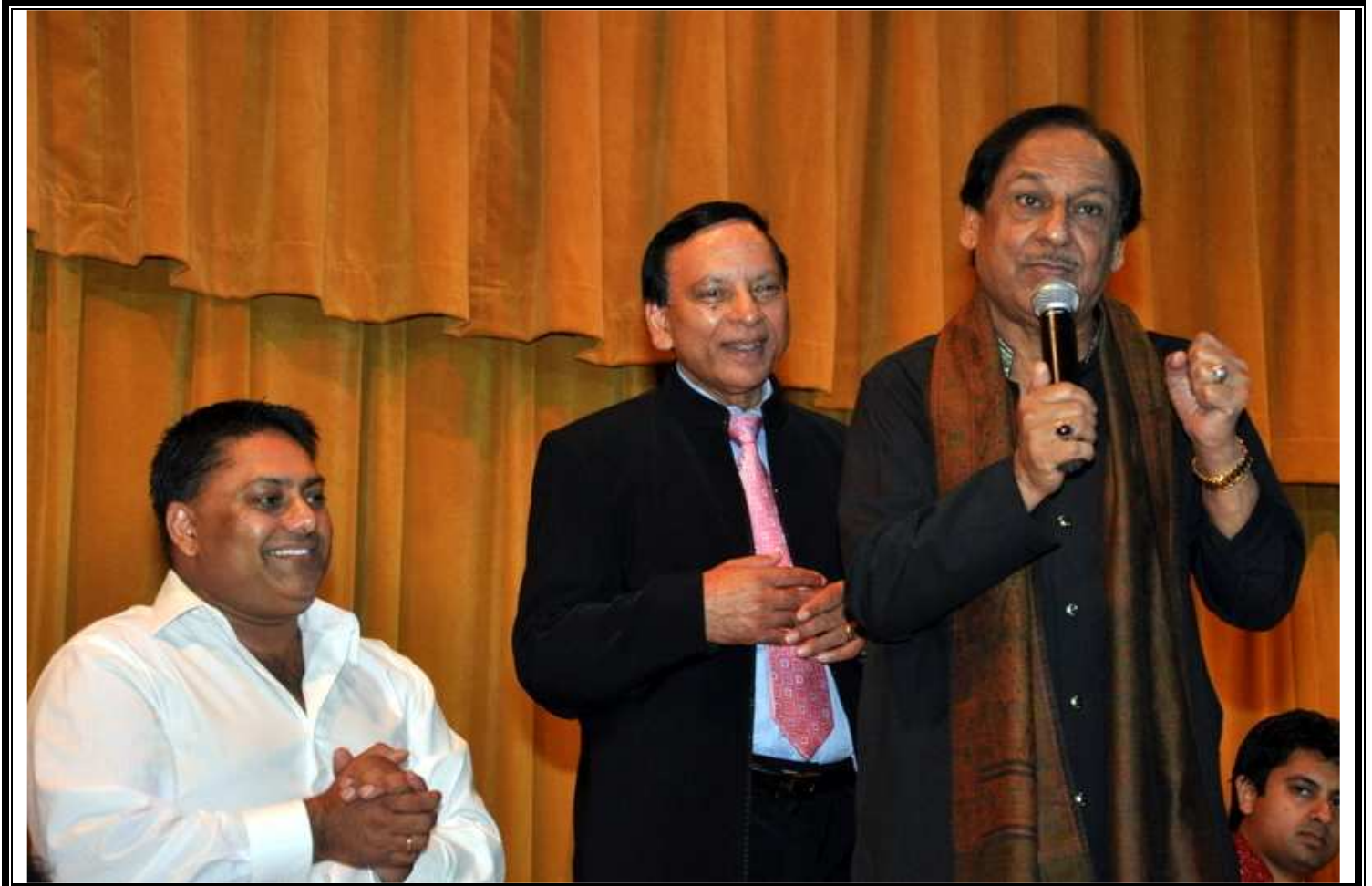
Ustad Gulam Ali, most amazing concert of the year with extreme magnitude